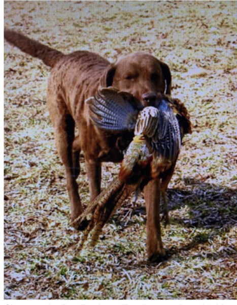
Chesapeake Bay Retriever Teagle returning with his bird on a pheasant hunt.

This dog does not have to learn much more in order to compete in the obedience ring at Novice level. If this dog is also a breed champion, he knows how to stand for a judge when being examined. We now have a dog who can